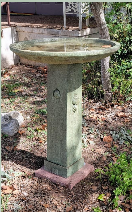
New Birdbath in front of church!